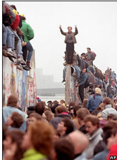
Berlin Wall 1989