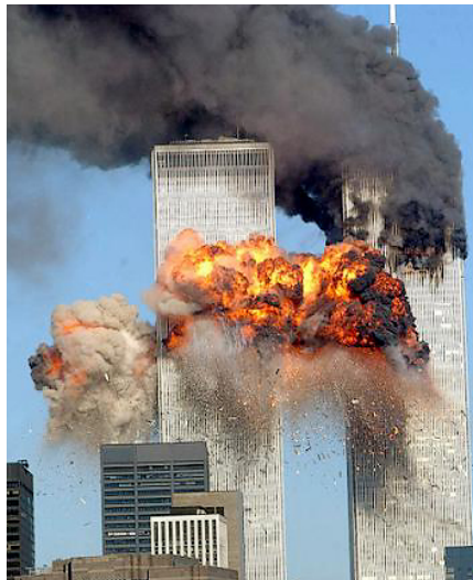
Twin Towers 2001